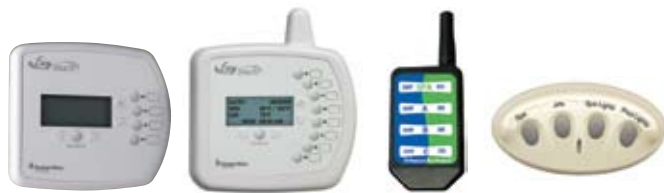
Indoor Control Panel (for 4 or 8 function control)